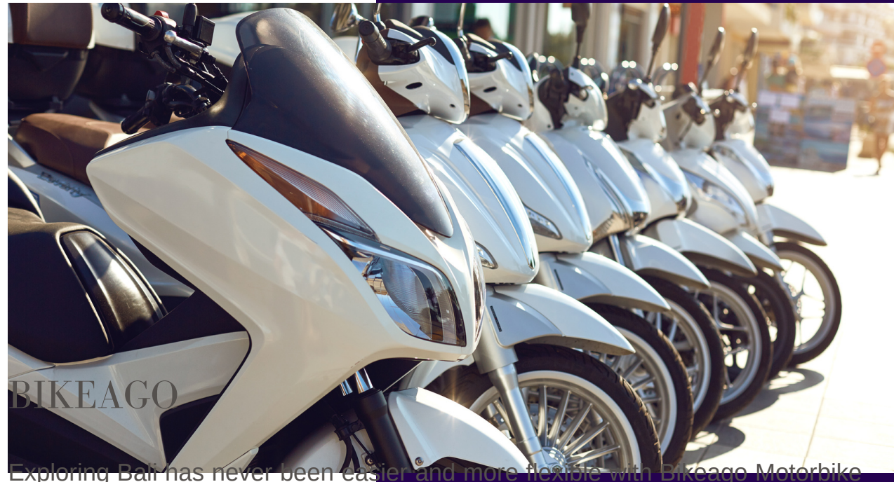
Rental. This trusted motorbike rental service provides comfort and security for travelers who want to roam the island freely.